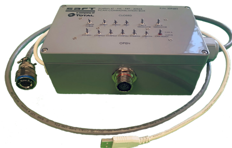
Xcelion® MIL-PRF-32565 Box